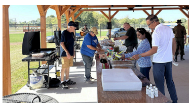
Radio on the River Live Event.