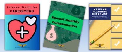
A few of the many eBooks offered by Legal Help For Veterans

Education is also a core component of the firm’s work. Legal Help For Veterans provides more than 20 free eBooks covering topics such as hearing loss, orthopedic conditions, caregiver rights, Aid & Attendance, the PACT Act, and property tax benefits. These resources are designed to help Veterans and families better understand the VA system—whether or not they ultimately pursue legal representation.