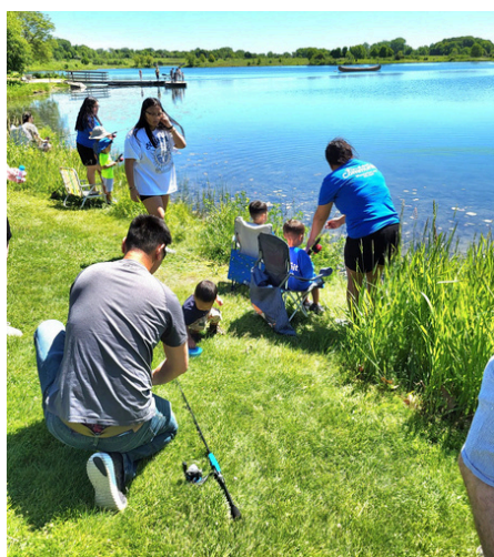
Blue Star Families is all about community—connecting military and Veteran families with each other and within their local neighborhoods.

“Wherever military and Veteran families go, they deserve to feel at home—welcomed, included, and celebrated. At Blue Star Families, we’re proving that military life can be not only manageable, but joyful. Because when we stand together, we don’t just support our families—we lift them up, strengthen our communities, and remind the world that military life is a source of pride and connection, ” said Roth-Douquet.