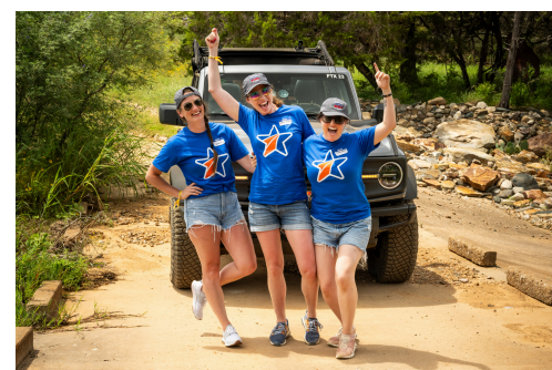
Blue Star Families offers once-in-a-lifetime experiences like the Ford Proud to Honor Bronco Off-Roadeo.

Blue Star Families follows a simple model: Listen. Partner. Share. Act. It listens to families, partners with leading organizations, shares insights, and acts on what is needed most. Serving both military and Veteran families—including active duty, National Guard, Reserve, and transitioning service members—Blue Star Families offers multiple ways to connect, engage, and find support.