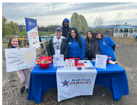
Outdoor programming fosters belonging, strengthens bonds, and boosts overall well-being.

The impact is measurable. Findings from the annual Military Family Lifestyle Survey shaped provisions in the 2025 National Defense Authorization Act, resulting in increased pay for junior enlisted members, expanded childcare, and enhanced employment support for military spouses.