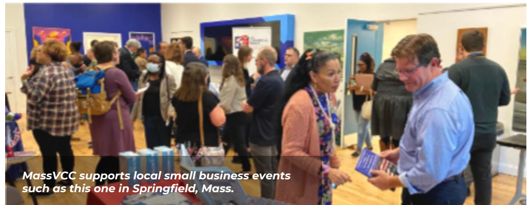
MassVCC supports local small business events such as this one in Springfield, Mass.