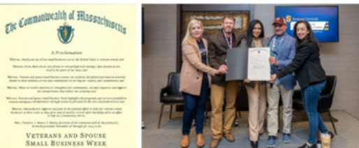
What a week it's been! We are incredibly proud to have celebrated our amazing veteran and spouse entrepreneurs and small business owners across Massachusetts.

For more information or to join the Massachusetts Veterans Chamber of Commerce, visit massvcc.org .