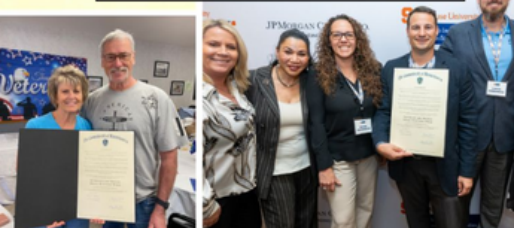
MassVCC celebrates Veteran and spouse entrepreneurs.