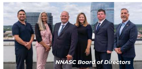
NNASC Board of Directors

Understanding that no one is better equipped to serve Tribes than Tribes themselves, NNASC has gained widespread support from Tribal leaders, governments, and economic development corporations. Exclusively