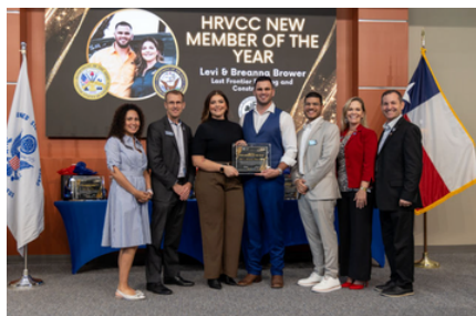
Houston Regional Veterans Business Awards Luncheon November 6, 2024.

HOUSTON REGIONAL VETERANS CHAMBER OF COMMERCE ★★★★★