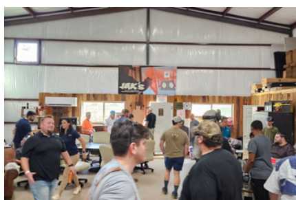
HRVCC Range Day September 13, 2024.