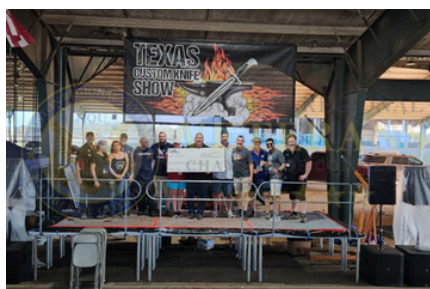
Texas Custom Knife Show 2024 November 9, 2024.