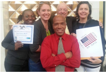
Certification graduation celebration lunch at the Golden Nugget, Las Vegas