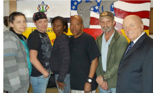
First class at Veterans Village, Las Vegas, with unhoused veterans

In addition to providing certifications, VSN partners with the National Veteran Business Development Council's (NVBDC) MVO Task Force to further support veterans in their careers. This collaboration helps increase VSN's reach and impact, ensuring more veterans have access to the resources and support they need to thrive.