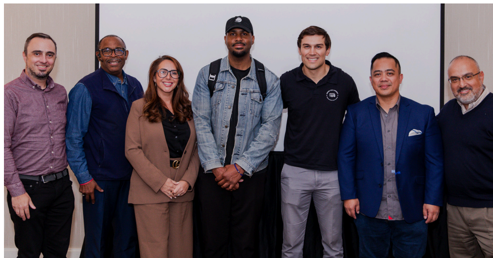
Civic Communities Veteran Pitch Contest Group