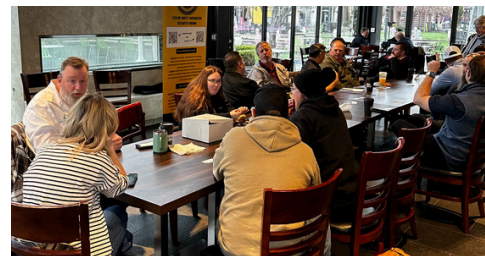
Monthly VetWorking Session

While the focus is on veteran entrepreneurs, the VEA is also committed to supporting veteran spouses. Belden emphasized that veteran spouses are often overlooked, even though they play a vital role in maintaining the homefront and face their own challenges during the transition to civilian life. By including spouses in its programs, VEA ensures that both veterans and their families have the tools they need to succeed.