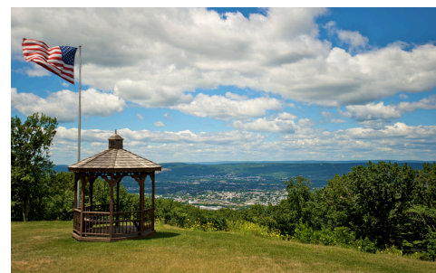
The view from Banyan Treatment Center’s Clearbrook, Pennsylvania location.