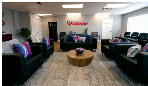
The MVIR group room at the Banyan Pompano property.