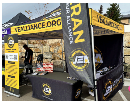
VEA Tent at Local Idaho Event Connecting with Potential Members