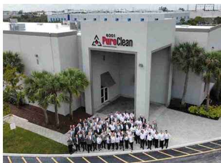
PuroClean team in front of the Tamarac, FL Corporate Headquarters.