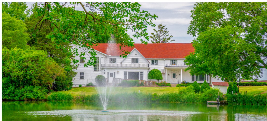
The Banyan Heartland property for veterans and active-duty service members.

Banyan also provides aftercare planning, family services, and alumni support, ensuring veterans have ongoing resources once they complete treatment. Many veterans who go through Banyan’s programs return to their communities, ready to rebuild their lives and reconnect with their families.