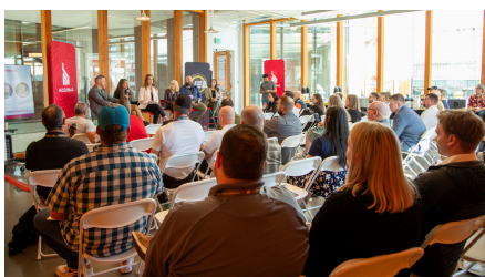
VEA Business Panel at the Boise Entrepreneur Week