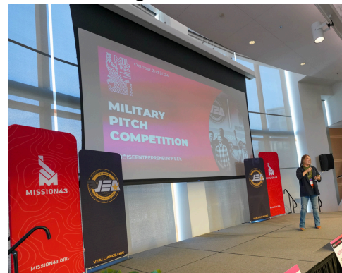
VEA's Annual Military Track Pitch Competition Event

Those interested in supporting VEA can get involved in many ways. Though the organization is focused on Idaho, it welcomes support from anywhere. Whether you're looking to volunteer, mentor, partner, or donate, there's always an opportunity to help veterans and their spouses succeed. Learn more at vealliance.org .