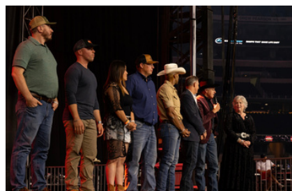
Geared to Give recipients recognized during the PBR World Finals in Dallas, TX.