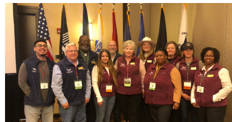
FVC staff at the 2023 Farmer Veteran Coalition Stakeholders Conference