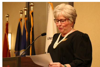
2023 Farmer Veteran Coalition Stakeholders Conference in Washington, D.C.